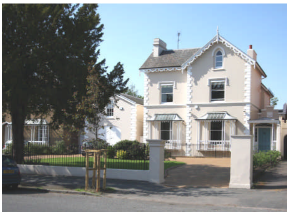
15 Leam Terrace

Many of the best house renovations were in Old Town. Those of us who live nearby are delighted by the careful and detailed repairs to Priory House (behind All Saints Church) and three houses in Leam Terrace which were honoured: Numbers 15, 39 and 45. All three were “good examples of Regency architecture”, well restored.