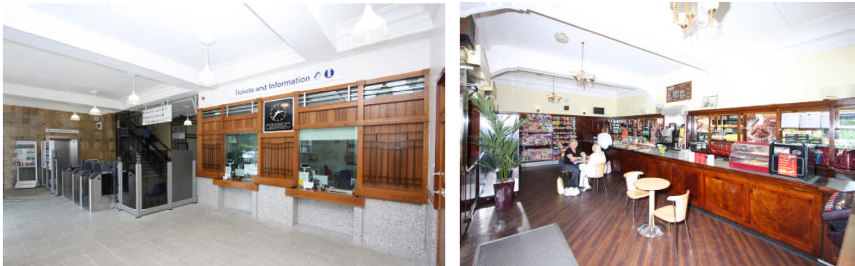
Ticket Hall and buffet at railway station

Many winners were businesses: in 43 Clemens Street with shop A Taste of Punjab, Lancaster House in Spencer Street, the former George Hotel in Chapel Street, 106 Regent Street, 6 Bedford Street and of course the railway station.